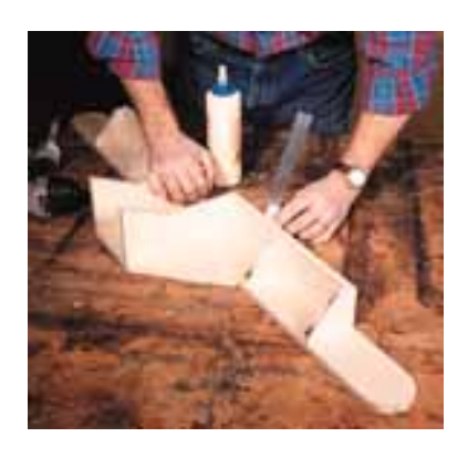
As you assemble the fence, make sure it is square along its length. Be sure and check it again after it is clamped up.

Now make the hole the router bits pass through. Leave a ledge about 1/2" wide all around for the removable